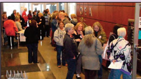
CEA members pack the OEA building to gather the 1,000 signatures required for the "down payment" to get to the next step in repealing S.B. 5.

On Sunday, Apr. 3, hundreds of Columbus Education Association members converged on the OEA Headquarters building in downtown Columbus with one thing in